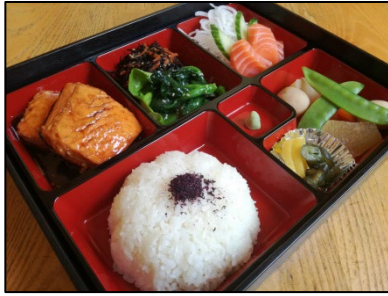
SALMON TERIYAKI BENTO