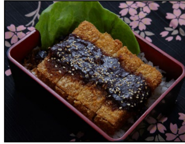
TOFU KATSU JŪ